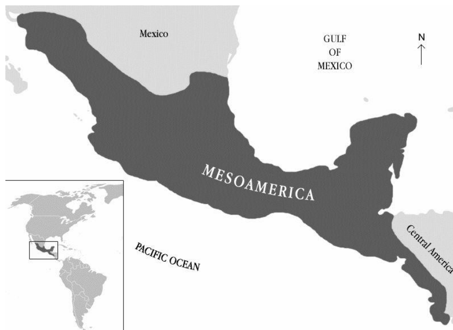
Map 1. The Mesoamerican area (adapted from http://mapsof.net )

The Mesoamerican linguistic area occupies an enormous territory that encompasses Central and Southern Mexico, Belize, and Guatemala (see Map 1). It extends along the Pacific coast from Northern Mexico to the coast of the Honduras and Nicaragua. The frontiers of the Mesoamerican area have been debated, and their gradated nature is universally accepted (van der Auwera 1998, Chamoreau 2017). For example, some researchers prefer to extend the northern frontier further to the north, while others limit it to Central Mexico; this issue will be discussed in Section 3.