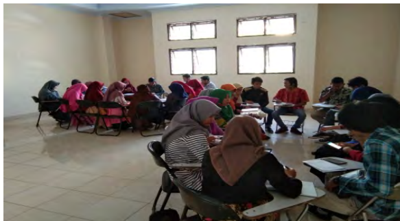
Collaborative brainstorming or case building

“It is noticeable that the students could collaboratively share their ideas and gave feedback orally to each other when presenting their descriptive essay using MindMapping software. Also, the students were actively engaged in debating for and against the implementation of the Indonesian national exam for the authorship of agree and disagree essay.....” [The instructor’s reflective journal]