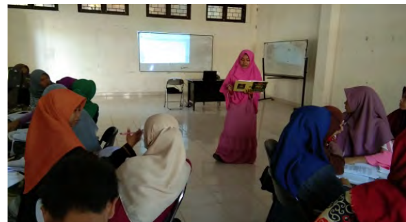
Presenting arguments on the Indonesian national exam