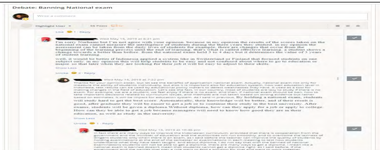
Figure 6. Online debating