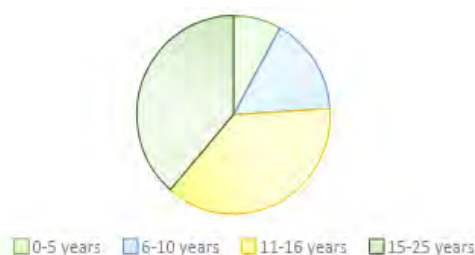
Figure 2. Respondents' seniority of education (in years)