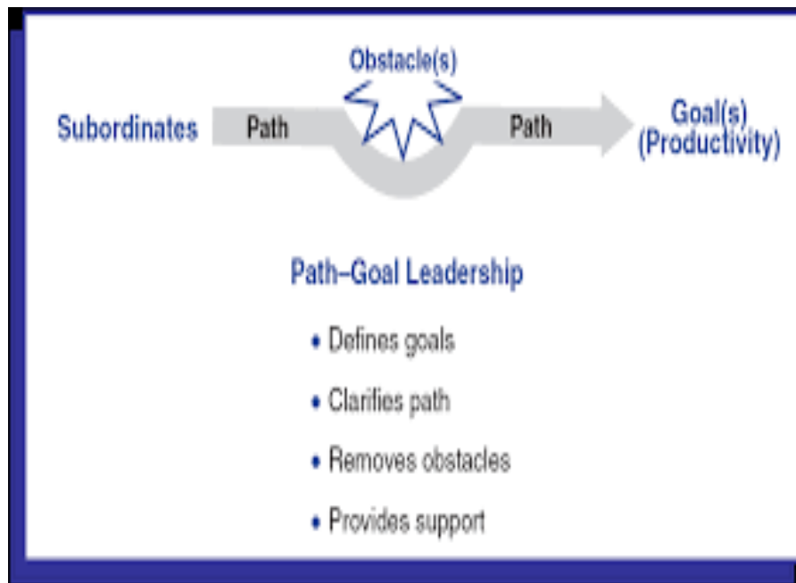
Figure 1.1: The Basic Idea of Path-Goal Theory