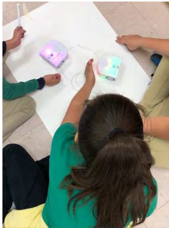
Figure 8. Working with multiple Thymio floor-robots

During this concluding lesson with floor-robots, there were four adults assisting students, including the cooperating teacher. The addition of three certified teachers and one graduate assistant limited any difficulty in managing behaviors; but, students remained engaged in groups. There was little to no off-task behavior observed by researchers. However, the researchers cannot determine if a single classroom teacher could effectively assist groups with a similar station lesson. Out of the seven stations, there were four adults readily available to assist. If this were a single classroom teacher, managing behavior and/or addressing students' questions may be more difficult.