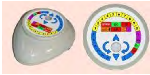
Figure 1. Roamer Floor-robot