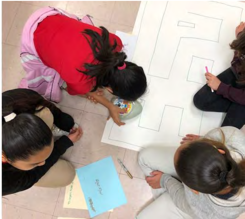
Figure 3. Working with Roamer at the Maze