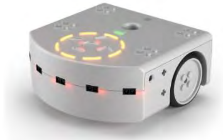
Figure 2. Thymio floor-robot

teach students how to identify and select a response. However, students often struggled with the Likert survey; and in this study, researchers determined that giving elementary student-participants the option, when possible, to answer yes or no, would produce a more accurate response. When developing any Likert survey, researchers “must adequately capture the specific domain of interest yet contain no extraneous content” (Hinkin, 1995, p. 969). Researchers wanted to capture the domain of interest, student-participants’ perceptions of floor-robots, in as accurate a fashion as possible. Multiple drafts of the survey were developed prior to finalizing the one used in this study to help ensure content validity. However, the survey was researcher-developed, and as such, reliability had not been established.