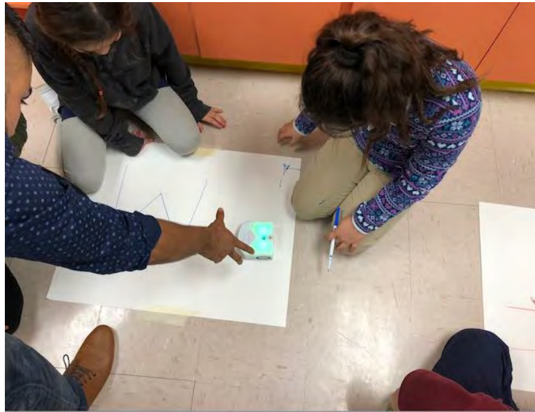
Figure 9. Assisting students