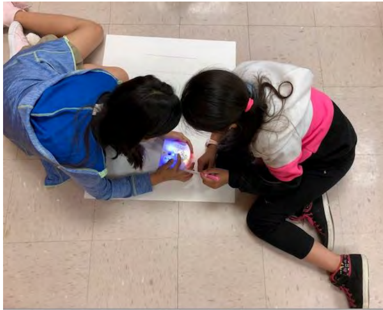
Figure 7. Programming Thymio to travel in circles