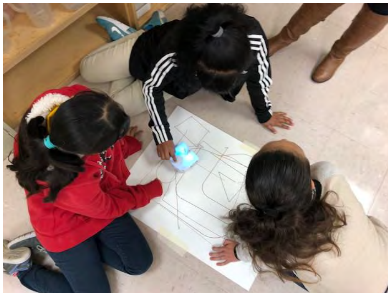
Figure 6. Working with Thymio

Students selected which exit they would program the floor-robot to travel toward; and students worked as a group, writing down code and analyzing the sequence of steps to ensure success.