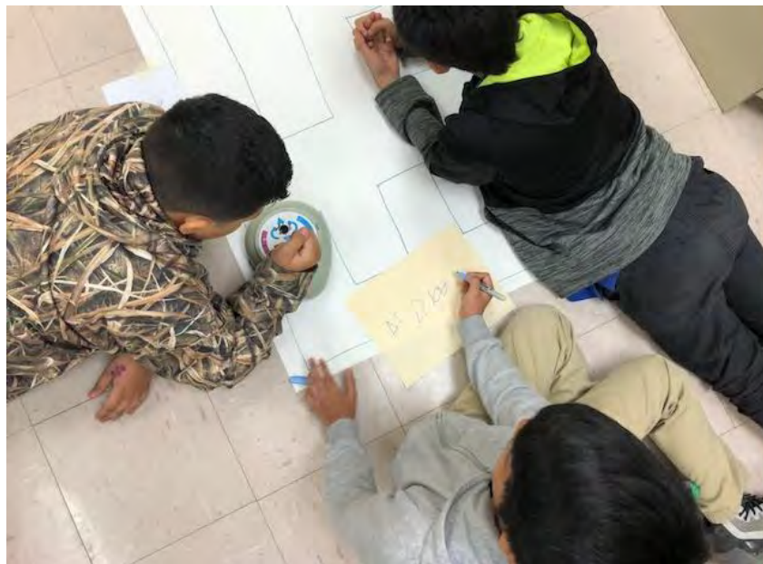
Figure 4. Writing code for Roamer

in groups of three to four, students were engaged with the floor-robots at different stations, moving between stations after twenty minutes. Data on this final engagement with floor-robots was gathered by researchers.