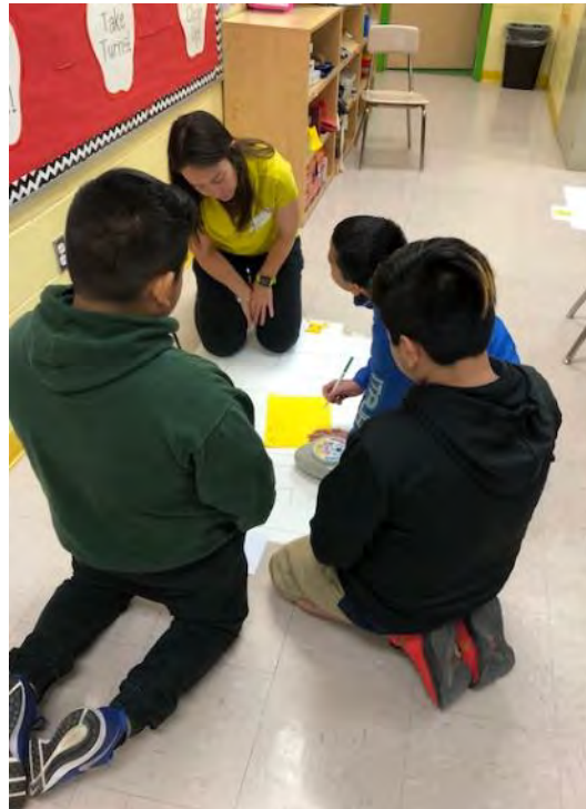
Figure 5. Assisting students