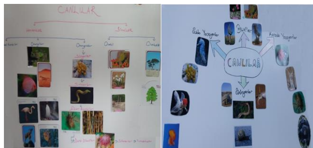
Figure 3 Examples of PSTs' first semantic networks