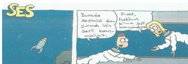
Figure 2 An example from cartoon completion activity (Özdemir, 2006; pp. 19)

Table 2 represents the dependent t-test for the differences between PSTs' pre and post-test Success-1, 2, and 3 scores. In Table 2, significant differences were found between pre-and post-test scores at all three stages of the three-tier test (Success-1, 2, and 3). It was revealed that all scores related to success were increased after treatment. It was also determined that the rate of correct answers given to the question in the first stage of the three-tier test was higher than the appropriate steps regarding the explanation of the answer and whether or not to be sure about the answer. Although tiers scores increased, average pre-and post-test success scores decreased. It is thought that the practices carried out throughout the research process