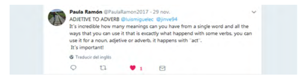
Figure 5. Student Twitter post

In terms of learning, all the participants stated that they used Twitter for general purposes, such as interacting with other users, sharing content and posting own information. However, in order to avoid distraction on students, Twitter was restricted to specific academic purposes while this investigation was carried out. In fact, 63% of the students indicated that they learnt to use Twitter academically because of the current study. In this regard, Prestridge (2014) mentions that Twitter as any other networking tool can be adapted into the educational field, with the appropriate technological approaches and the correct tracing. Therefore, students used the English lab to work on some activities in Twitter , as it can be seen in the following figures: