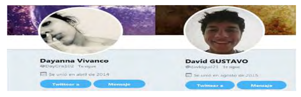
Figure 1. Students' Twitter accounts

According to the field research, 79% of the students indicated that they knew how to use Twitter before this study has started. This is an important aspect to be considered as BBC active (2017) suggests that nowadays social networks can become a VLE (Virtual Learning Environment) and allow students to access virtual rooms and use it as an extension of the physical room where the teacher and students can interact. On the other hand, four students (21% in total) answered that they did not know how to use Twitter at all because this social network did not seem interesting for them.