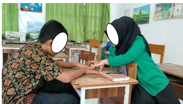
Figure 1. Autistic student activity, with special assistance from the teacher