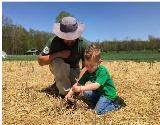
Figure 1. A Farm Sprouts preschooler works to harvest asparagus, guided by the Tollgate Farm Sustainable Agriculture Instructor.

Embodying a place-based perspective, farm-based programs also provide opportunities for children to become connected to a larger community and to the environment. For instance, maple sugaring is a common farm-based activity in the northeastern portions of the United States. This might involve children tapping a sugar maple tree, harvesting sap, and engaging with volunteers to produce syrup to be sold to the community or planting and harvesting sunflower seeds to be given to families to plant in their yards and community. Farm-based programs intentionally and naturally afford many opportunities for conversations and learning around food including the food system (i.e., where food comes from, how it grows, etc.). Intentional teaching, including direct experiences with the food system and interactions with people working with food, can bring these conversations to the forefront. Children in farm-based programs have unique opportunities to observe and interact with adult models to grow, prepare, and eat fresh food.