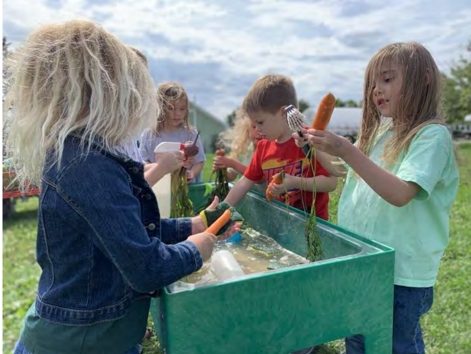
Figure 4. Farm Sprouts preschoolers wash vegetables harvested from the farm.

For example, in the fall children participate in a “veggie wash station,” (seen in Figure 4) set up with a bin of water, brushes, and towels before carrying the vegetables to a pretend play farmer’s market to be sold to their peers. This close connection to the source of the food and being a part of a community, which celebrates and shows gratitude for the process of growing it encourages children to take the risk to try new foods. Songs, children’s literature, and discussion related to the food system and characteristics of the food accompany snack time to guide learning.