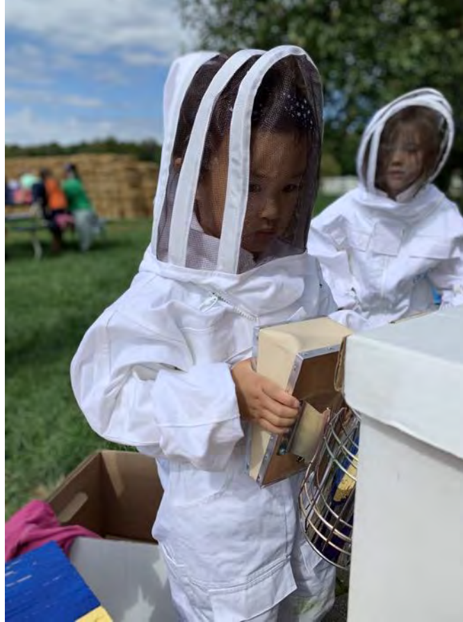
Figure 5. Farm Sprouts preschoolers engage in pretend play as beekeepers.