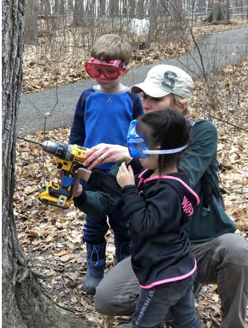
Figure 3. Farm Sprouts preschoolers work with their teacher to tap a sugar maple tree.

While this work is happening, children are engaged nearby in free play, balancing on logs, rolling in the snow, and closely inspecting discoveries made in the forest. Opportunities to engage in work activities and with materials in novel, safe, and developmentally appropriate ways provide for meaningful and essential connections for learning. The accomplishment of authentic work, by using real tools, supports growth and development in fine motor and problem-solving skills and self-confidence.