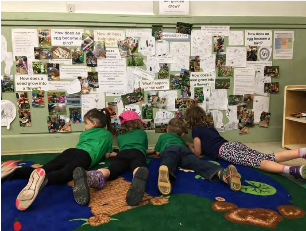
Figure 6. Farm Sprouts preschoolers review the content of the Wonder Wall in their classroom.