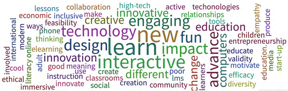
Hashtag Community Cloud

Further iterations of this study could include autofill and suggested hashtags to avoid typing errors. We are currently working on hashtag clouds that could be available to both the students and instructors to visualize community knowledge building. Instructors can also monitor tag clouds to help students get a bigger picture of discussion topics and find connections between the same. These types of activities facilitate “community-community interaction” and can be used for reflection and growth.