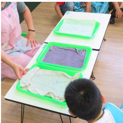
The Teaching Materials and Tools