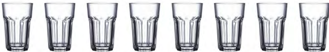
The Teaching Tools