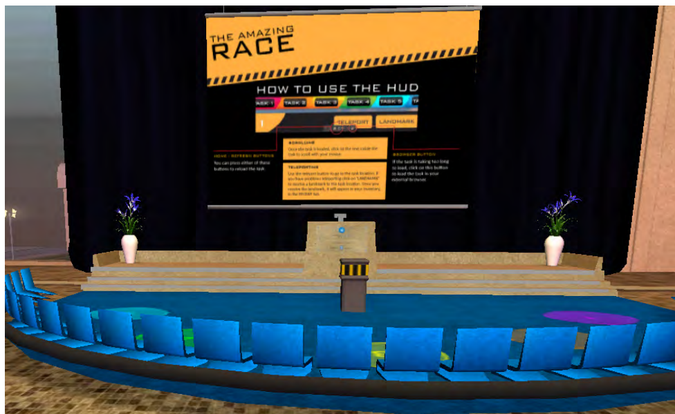
Figure 1. Virtual Auditorium in the Learning Island.

Note. A screenshot of the auditorium in SL on the Amazing Race day.