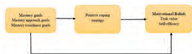
Figure 1: Proposed model

Perceived mastery goal orientations were assessed through the "Achievement Goals Questionnaire" (Elliot and McGregor, 2001) which has 15 items in four subscales: Mastery approach, mastery avoidance, performance approach, and performance avoidance. Two subscales were used in this study: Mastery approach (e.g., "I desire to completely master the material that presented in this class") and mastery avoidance (e.g., "I just want to avoid doing poorly in this class"). Students responded using a five-point Likert scale, ranging from 1 (strongly disagree) to 5 (strongly agree). The instrument was adopted into Turkish by Senler and Sungur (2007). In the present study, the Cronbach alpha coefficient was found to be .76 for the mastery approach and avoidance subscales.