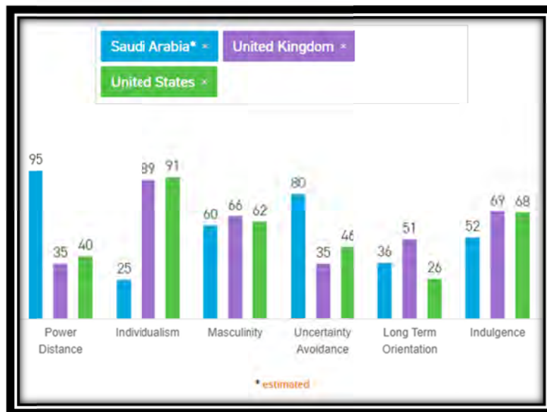
Figure 3. Hofstede's insights cultural dimensions 2020