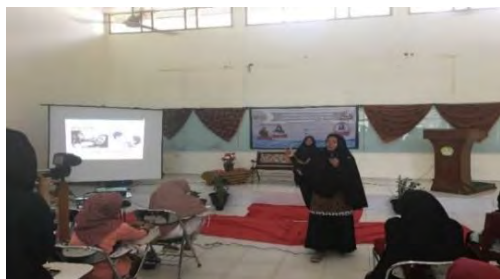
Figure 2. Seminar on anti-bullying campaign * all images shown here have got consent from all people seen in the images

After the presentation, the activity was then followed by a question and answer session and discussion with attendees who were all students from the Speaking class 3 as well as some students from other classes. The event was closed by giving souvenirs to the speaker(s) and photos session, as seen in Figure 3.