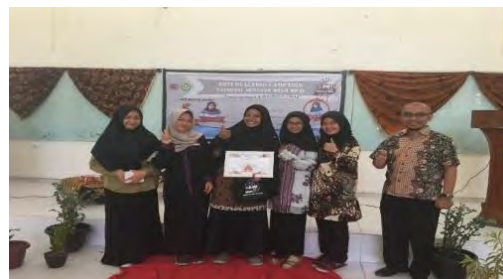
Figure 3. Token presentation to the speaker(s)

All seminar processes were carried out completely in English. In addition, the media team worked on the program, interviewed speakers and seminar/talk show participants. The audiences were asked on their impressions about the event and also the general messages they wanted to convey, including feedback on the performances. Interviews and the coverage of this event were then published on social media such as YouTube as shown in Figure 4. This coverage was part of the exam assessment, especially related to how to be a journalist (news report), one of the skills taught in the Speaking 3 course.