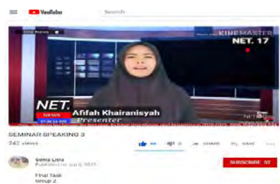
Figure 4. News report on Youtube

All seminar processes were carried out completely in English. In addition, the media team worked on the program, interviewed speakers and seminar/talk show participants. The audiences were asked on their impressions about the event and also the general messages they wanted to convey, including feedback on the performances. Interviews and the coverage of this event were then published on social media such as YouTube as shown in Figure 4. This coverage was part of the exam assessment, especially related to how to be a journalist (news report), one of the skills taught in the Speaking 3 course.