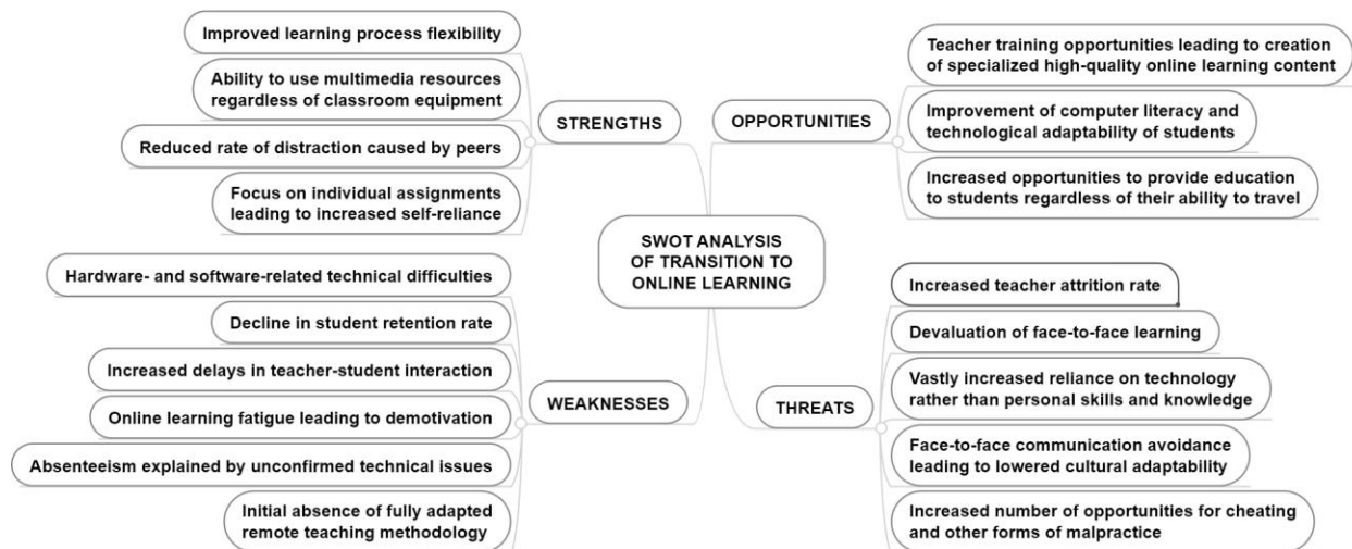
Figure 3. SWOT Analysis of Transition to Online Learning (Author's Data)

The research findings demonstrate the impact of various methodological, technological and psychological issues caused by the emergency transition to online learning on the adaptability of international students and offer an insight into the perceived advantages and disadvantages of the system as well as its opportunities and threats both in the short-term and the long-term perspectives. In order to categorize these variables and present their overview, the principles of strengths, weaknesses, threats and opportunities (further SWOT) analysis were implemented to build the SWOT mind map diagram, see Figure 3: