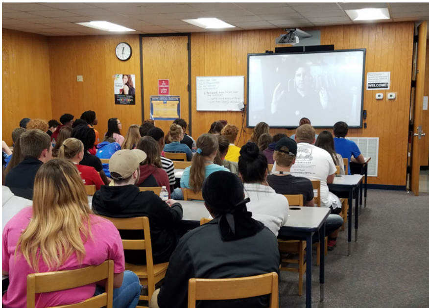
Students at James F. Byrnes High School in Duncan, SC, participate in a Skype visit with author Matt de la Peña who discussed challenges to his novel Mexican Whiteboy.