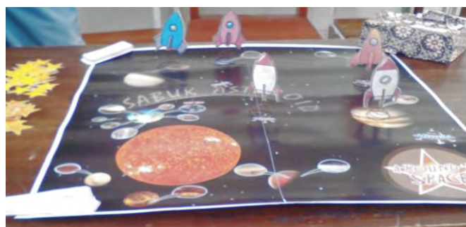
Figure 4. Round space game

This board game discusses the meaning of history, there are chance cards, destiny cards, question plots, bomb signs, and flip images. The way to play is very simple, the player only needs to roll the dice, and follow each of the instructions in each game box. Historical material which is used as the basis for making anonymous board games is material regarding the concept of history. How to play is explained as follows, the player consists of 5 people, each player rolls the dice, if one player gets the highest number of dice then he becomes the first player, the first player after rolling the dice will get the number of steps he has to run the token on each box when stopping in a box, the player must follow the instructions in the box. The instructions can be various, such as answering questions about the meaning of history, the importance of learning history. If the token stops at the bomb sign, it means that the player cannot continue the game for one round. This game is over if one of the players reaches the finish, the player who reaches the finish first is declared to win the game. Furthermore, the Round 'space game is complete with spaceship tokens and stars, as shown in Figure 4 below.