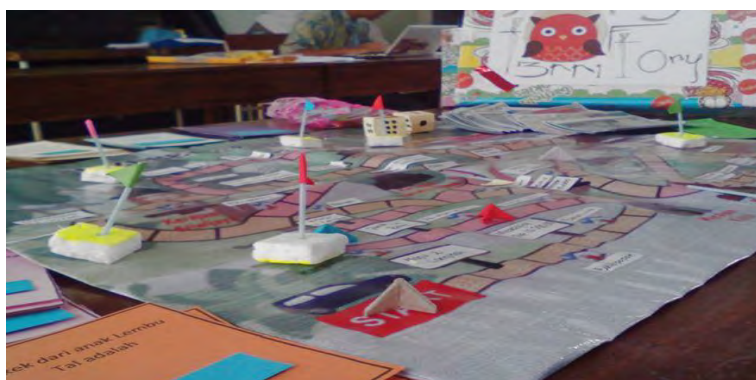
Figure 5. Seizure of territory games

How to play, the player must have a maximum of 5 members to start on the specified planet, the first turn player determines the planet he wants to visit, then jumps to the next planet in the order of the planets in the solar system. Every player is on one planet, he is obliged to answer the questions on that planet, if he answers correctly and progresses according to the order of the planets correctly gets two gold stars, if wrong then he does not get stars, and must return to the previous planet. The player who gets the most stars is the winner. Meanwhile, students then refer to the game as the Seizure of Territory that can be shown in Figure 5 below. This game tells the story of power struggles between kingdoms in the Hindu-Buddhist era.