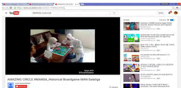
Figure 6. MANSA Historical Board game uploaded on YouTube

Furthermore, instructional media that have been developed by students on historical subjects in the form of the MANSA Historical Board game are also uploaded on social media such as YouTube. This is done with the aim that high school students, teachers, practitioners, and other researchers can use these learning media and can develop learning media similar to modify them. Therefore, Figure 6 shows the MANSA Historical Board game that has been uploaded on YouTube.