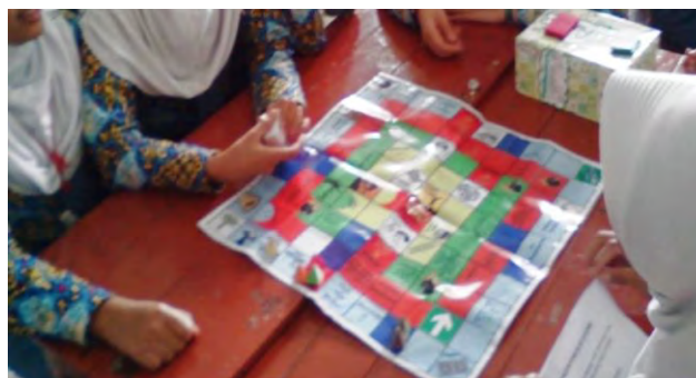
Figure 3. Anonymous game

The results of the MANSA Historical Board game by students can be shown in Figure 2 to 4. There is a student's group who named the Board in the form of an-Anonymous Game as shown in Figure 3 below.