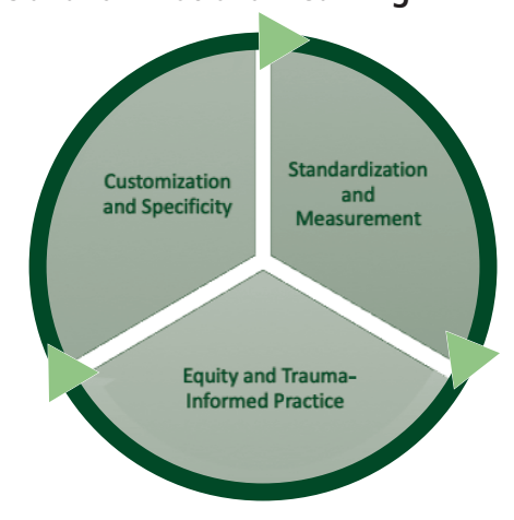
Figure 2. Advancing Equity in OST Through Social and Emotional Learning

state that OST practitioners must have a working understanding of different approaches to SEL, gain clarity about exactly how they are supporting SEL skills, and be intentional about collaborating with school partners. When OST programs are deliberate about how they address and support SEL, outcomes improve, and there is more alignment among SEL efforts and expectations across settings. Furthermore, components of SEL programs should be compatible with the organization's mission and pedagogical approach and with the needs of the specific population being served (Jones et al., 2017). Because OST settings have smaller blocks of time to work with than schools do, OST SEL programs should be engaging and should match the