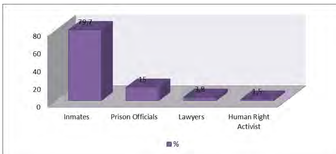
Fig 3: Bar Chart Showing Percentage Distribution of Stakeholders according to Status

Table 5 and figure 3 above respectively show the distribution of the stakeholders according to their respective status. It is shown that out of 1329 (100.0%) of the stakeholders that participated in this study, 1059(79.7%) were prison inmates, 200(15.0%) were prison officials, 50(3.8%) were lawyers while 20(1.5%) were human right activists. In this result, majority of the stakeholders that participated in this study were prison inmates while the least percentage was the human right activists.