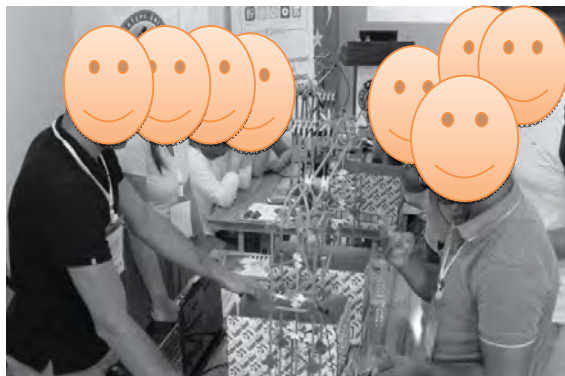
Stage 5: Test