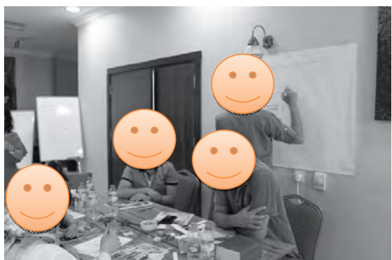
Stage 3: Plan