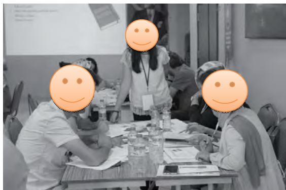
Stage 1: Define