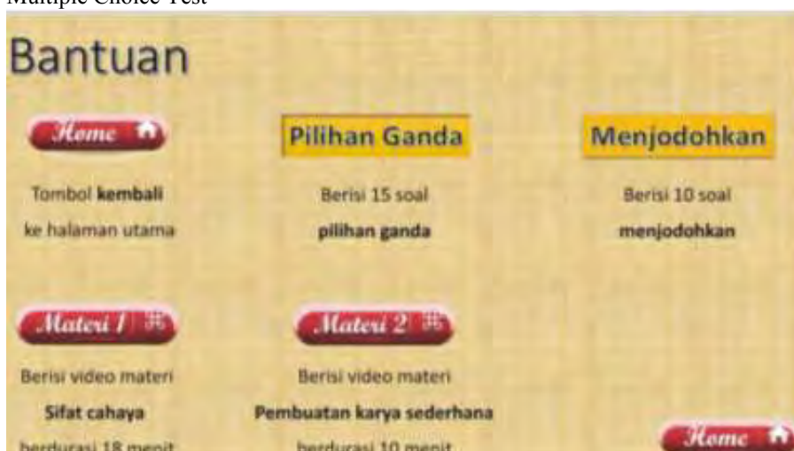
Figure 6 Help Section

Furthermore, the media has validated by prospective user and experts to examine the feasibility of product. User validated the feasibility on visual, material and language aspects. Thus, the media experts validated on learning goals, content quality, linguistic and video display as well as the ease of video aspects. The materials expert also stated that the media is feasible, well developed and ready to practically use in aspect of language, presentation and facilitation and video display. The result concluded that the initial motion graphic video media gets a feasible and good category to proceed to the