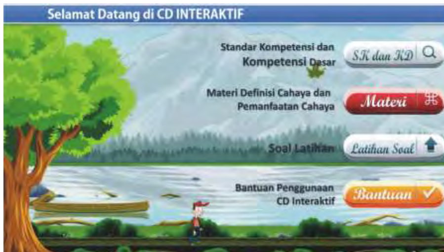
Figure 1 Main Menu

light in daily life. In Exercise section, students will face two form of question to test their mastery. Multiple choice and matching test are selected based on the suitable characteristics of primary school learners. Then, in Help section, it briefly shows the contents of the menus and buttons in disk. It functioned to help students to understand use of menu or section. It is provided to guide the user to follow the desired menu.