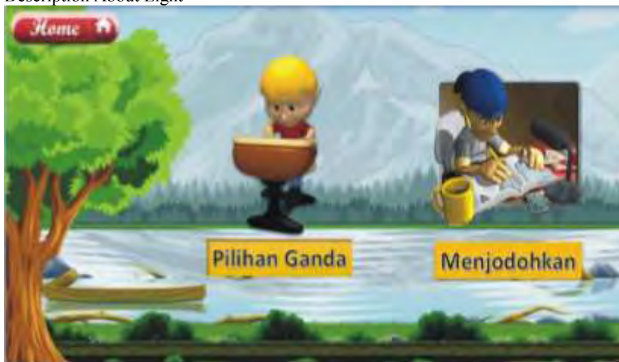
Figure 4 Exercise Section