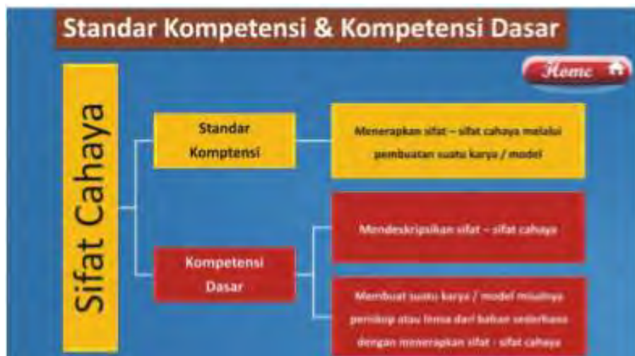
Figure 2 Learning Objectives Section