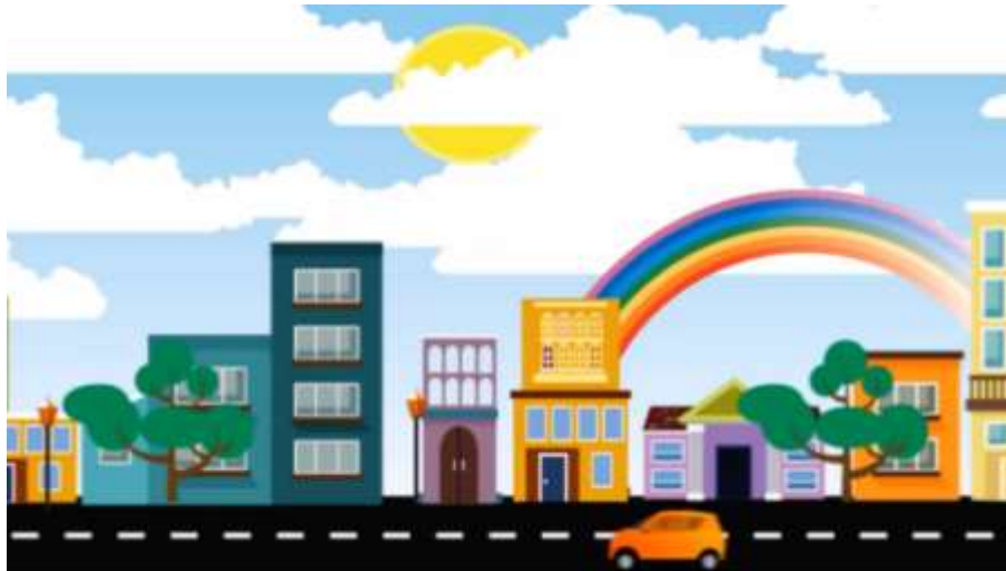
Figure 3 Description About Light