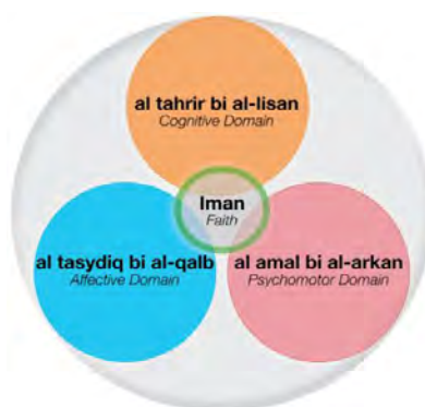
Figure 1. Islamic education character framework