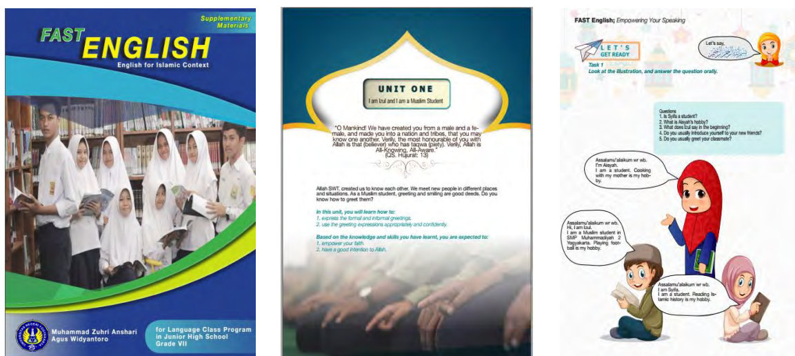
Figure 2. The example of the design

The book cover is presented in the following Figure 2. The name of book is FAST English. FAST stand for Fathonah , Amanah , Siddiq , and Tabligh . Those are the characters of the Prophet Muhammad SAW and they are the configuration of religious characters proposed by Permendiknas [16]. In all units, the Islamic values are inculcated in the learning materials. Besides the learning objectives, two learning expectations are formulated based on the internalized values in the unit cover. In the unit 1, for example, the students are expected to empower their faith and to have a good intention to Allah. In the materials page, the Islamic illustrations are provided for the students. The cartoon is modified from https://pngtree.com . It can be seen from the following example of the design.