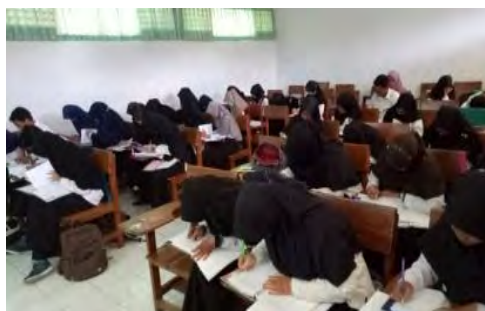
Figure 2. Evaluation activity

Furthermore, Figure 2 shows a picture of the students' activity when working on the assignment. It was seen that all students were serious in doing the cursive handwriting assignments.