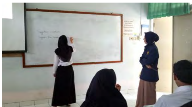
Figure 3. Answering question activity

Finally, Figure 3 illustrates when the students have the opportunity to answer the lecturer's questions. Students are asked to come forward and write their answers on the board using upright letters.