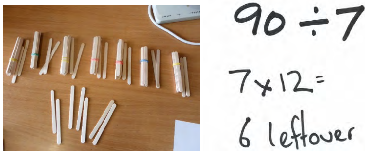
Figure 5. Samples from Student Sally (Year 5)

Sally (Year 5) was also unable to work out the answer to 90 \div 7 but did so when using the bundling sticks. Following is the conversation between Sally and the interviewer. Figure 5 contains her work samples.