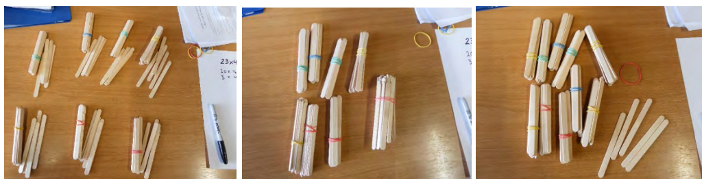
Figure 2. Samples from Student Lisa (Year 5)

It can be seen that there is much wider range of responses to Question 2 than for Question 1. Only ten students represented the multiplication process by showing seven groups of 15, combining the seven ten bundles and the seven bundles of five, before regrouping the fives as tens and showing the total. This reflects the partial product method and also the algorithm. Typical samples of a student's work in completely representing the process is shown in Figure 2 . Lisa (Year 5) made the seven groups of 15 (picture 1 in Figure 2 ), then put the seven bundles of 10 together (picture 2 in Figure 2 ) and finally regrouped the 35 bundle into three tens and five singles (picture 3 in Figure 2 ).