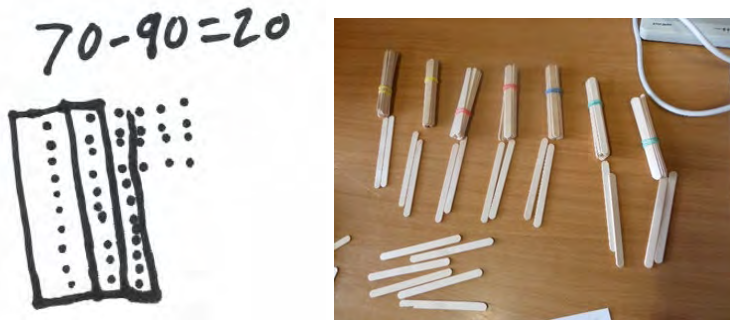
Figure 6. Samples from Student Zac (Year 6)

Zac (Year 6) also had difficulty with 90 \div 7 , as the following conversation shows. However, when he used the bundling sticks, he was able to work out the answer. Figure 6 shows his work samples. The first picture shows the unfinished array that he drew initially.