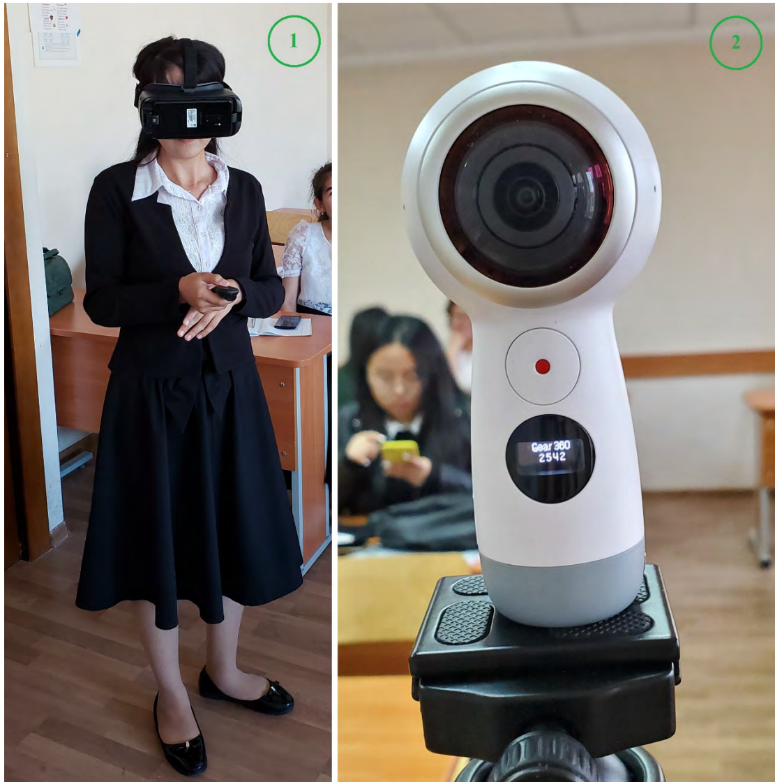
Figure 2. VR technology: (1) Samsung Gear VR, and (2) Samsung Gear 360.