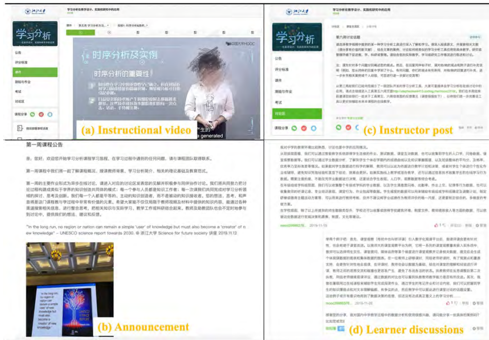
Figure 1. The MOOC platform.

We used a combination of pedagogical strategy, a learning analytics tool, and a social learning environment to foster learner engagement in discussions. First, we used a knowledge-construction pedagogical strategy and related prompts, such as sharing and comparing information, elaborating of opinions, exploring dissonance among ideas, negotiating meanings, and synthesizing knowledge (see Figure 1). Second, from a technological perspective, we designed and devised a student-facing learning analytics tool to demonstrate learners' discussion processes with the interaction, topic, and epistemic networks (see Figure 2). The interaction network demonstrated learners' social interactions with others; the topic network demonstrated learners' use of keywords; and the epistemic network demonstrated five dimensions (i.e., concept, procedure, fact, strategy, and belief) shown by the learners in their posts. This analytics tool was hosted as a Web page and embedded in the course discussion forum. Finally, we built a social learning environment through the use of social media and MOOC forum. We used the group function of a popular Chinese social media tool named WeChat to build a self-organized community through which learners could foster a sense of belonging (see Figure 3). We also designed a social section in the forum for learners to share personal life stories or interesting topics.