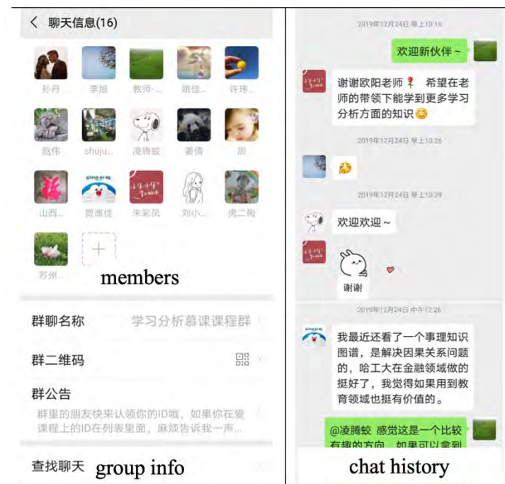
Figure 3. The WeChat group.

From “An Application of a Learning Analytics Tool in MOOC,” Fan Ouyang research team, n.d. ( https://8jrsl.coding-pages.com/ ). In the public domain.