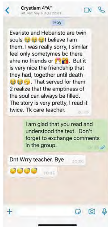
Figure 1. Example of the textual production of a student from the experimental group

When comparing the number of messages used by students, the prevalence of voicemail, as opposed to text messages, was noted. On average, each student recorded 98 text messages (approximately 48 words each) and 143 voicemails (approximately 73 words each) during the quarter, demonstrating that students are more comfortable sending voicemails.