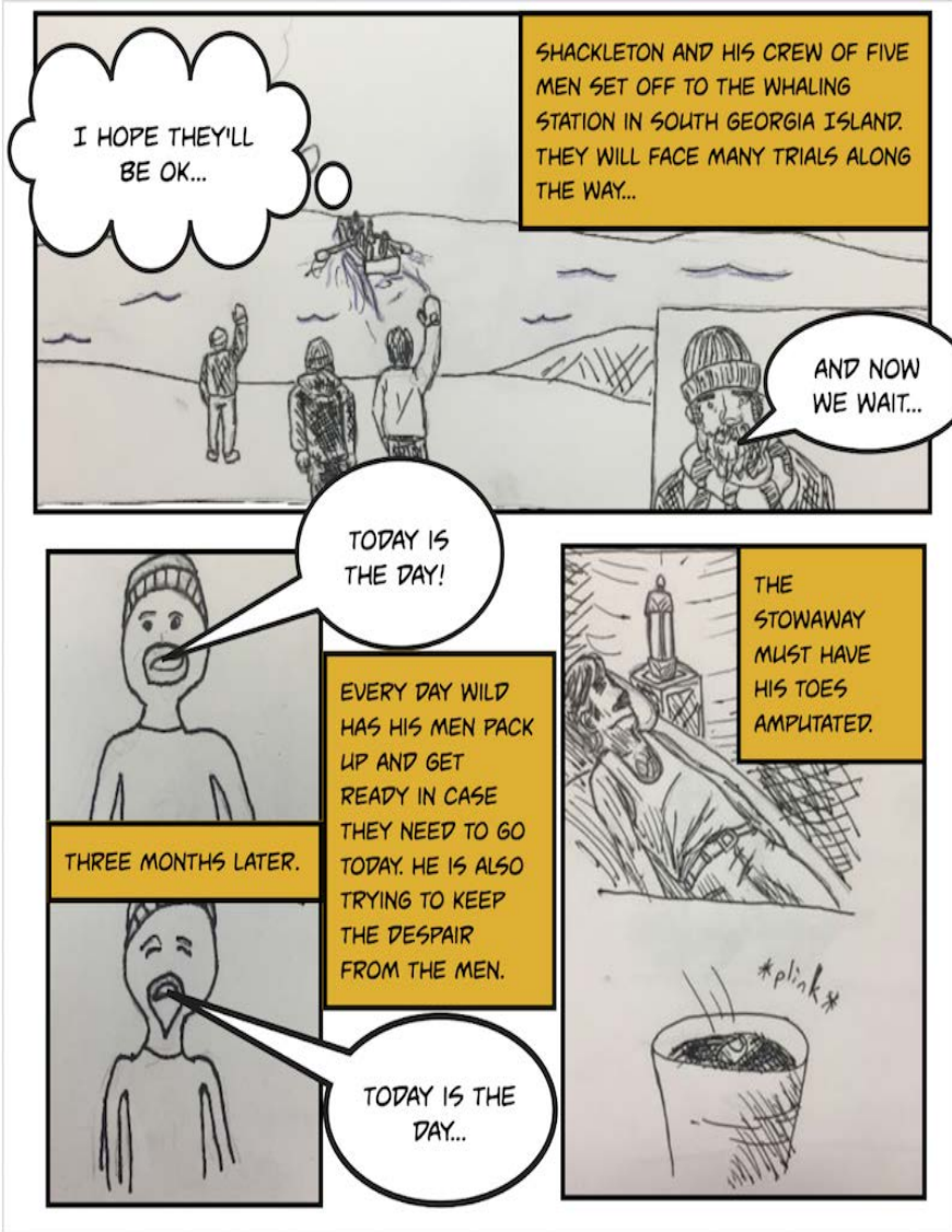
Figure 2: panels from Brett and Elliott's graphic novel, 2019

week period and is the centerpiece of our semester's work. See two different videos of this partnership in action here and here . Below is one example of the Shackleton Graphic Novel project: