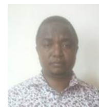
(+ Corresponding author)