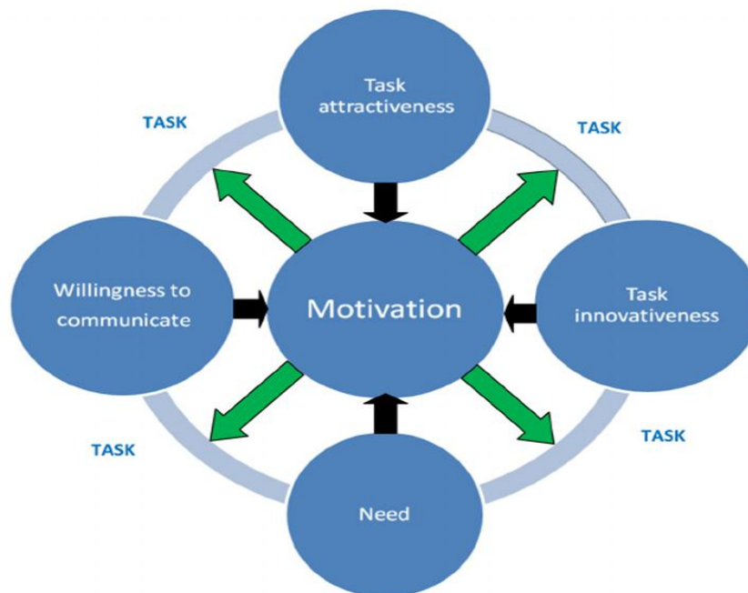
Figure-2. Motivation and task cycle in the process.