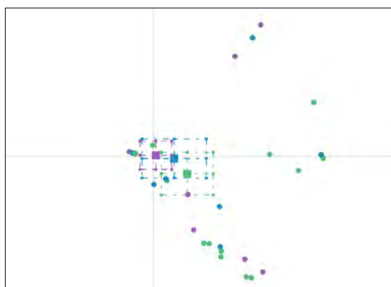
Figure 1. Projected points, mean location, and 95% confidence intervals for the utterances of U.S. (blue), Kenyan (purple), and Finnish (green) participants.

Figure 1 presents the projected points of each utterance on the two-dimensional ENA space, which accounts for 41.3% of the variance in the data. The blue dots represent the projected points for the utterances spoken by student participants from the U.S., while the purple and green dots are those of students from Kenya and Finland, respectively. The mean location of each group is indicated by the square of the same color, with the surrounding box signifying the corresponding 95% confidence intervals.