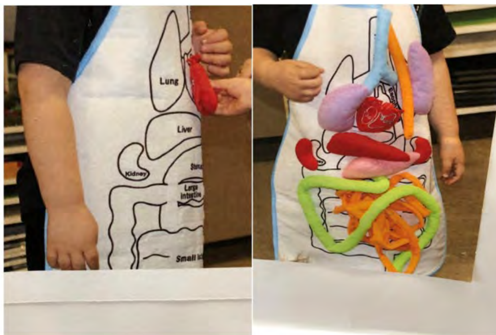
Figure 2. Example of Digestive system model in ELC 3 room

these themes, exemplars from teachers' planning documents and interview responses provide an interpretive view of their beliefs and practices in using technology for children's science engagement (Campbell & Jobling, 2010).