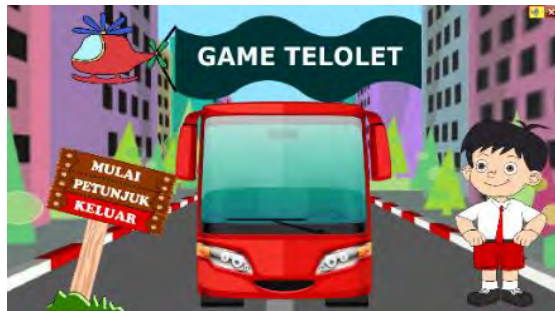
Fig. 2. Design of Telolet Game

The following is the front page design of the "telolet" educational game.