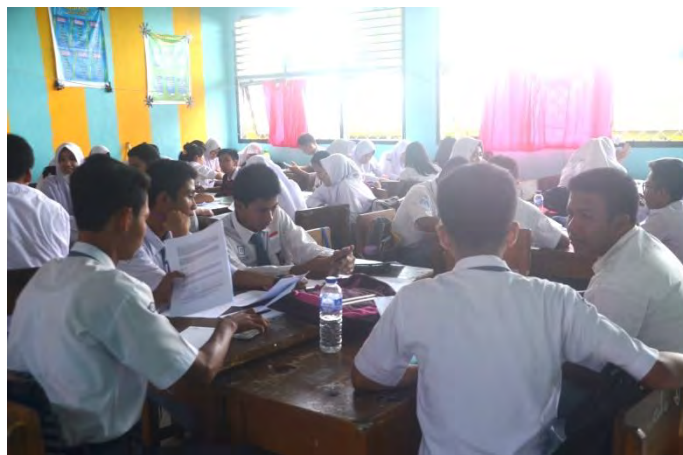
Figure 1. A science classroom containing 40 students

A picture depicts a crowded situation of a classroom in one secondary school in Jambi city is presented in Figure 1.