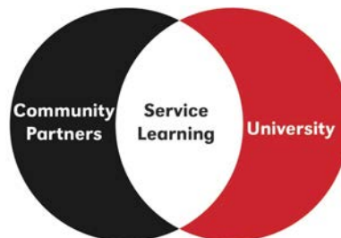
Figure 2: Traditional service-learning model

connect course context with real-world experiences. Service-learning faculty collaborate with community organizations as co-educators and encourage a heightened sense of civic engagement and personal responsibility for students while building capacity and contributing community impact (UNO SLA, 2019). Figure 2 shows the traditional service-learning model.