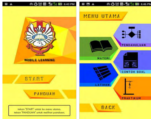
Figure 1. Layout of Beginning Part and the Main Menus in the Mobile App

The learning purpose is given in the introduction. The scope of the material which is covered in the mobile app is also shown in the concept map (see Figure 2).