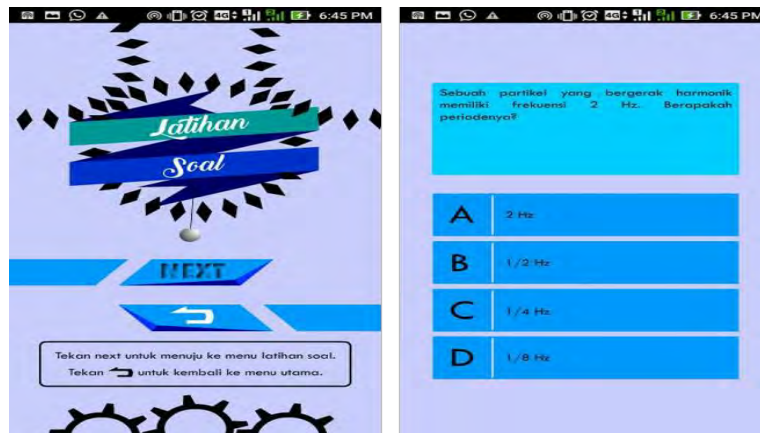
Figure 4. Exercise in the Mobile App

This study is still a preliminary study which needs more comprehensive investigation on the mobile app impacts in the physics learning process. In this study, we just investigated the impact of the use of mobile app on the cognitive aspects, whereas physics definitely not only includes cognitive aspects. Future study on this mobile app use in the physics learning is still required.