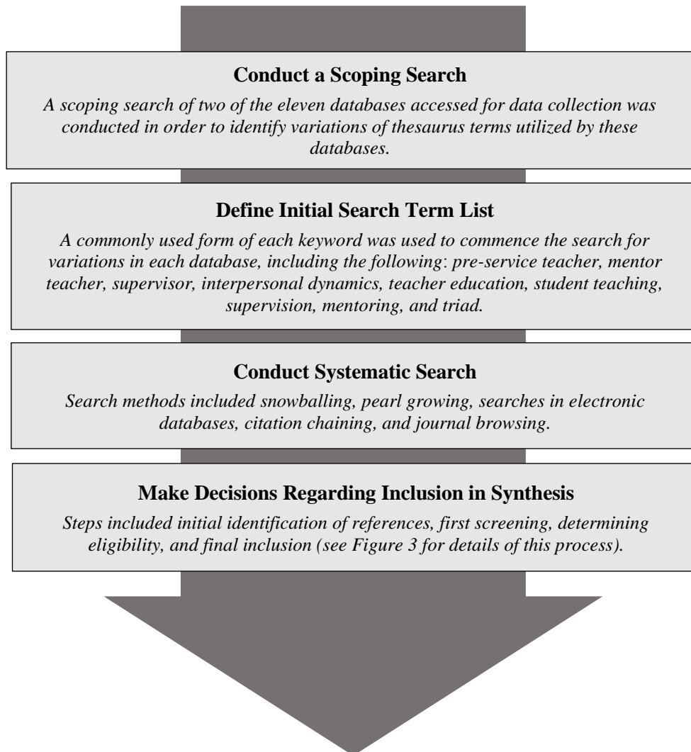
Figure 2 Steps in the Data Collection Process

The collection of data for this synthesis followed a process shown graphically in Figure 2. After the scoping search was conducted and the initial list of search terms was established, a systematic search for literature was conducted, utilizing the five techniques discussed in this section. Once the search was complete, the collected studies were evaluated for inclusion in the current synthesis based on the parameters established previously.