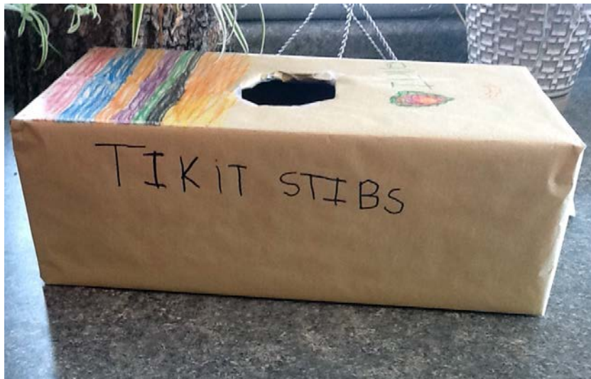
Figure 2. A box to collect movie tickets is labeled as “TIKIT STIBS” [ ticket stubs ].

The children also created movie posters to inform others about the films featured at the theatre, menus to inform customers as to what food they could purchase at the concession stand and for how much, and labels to identify the items stored on the shelves in the concession stand (Figure 3).