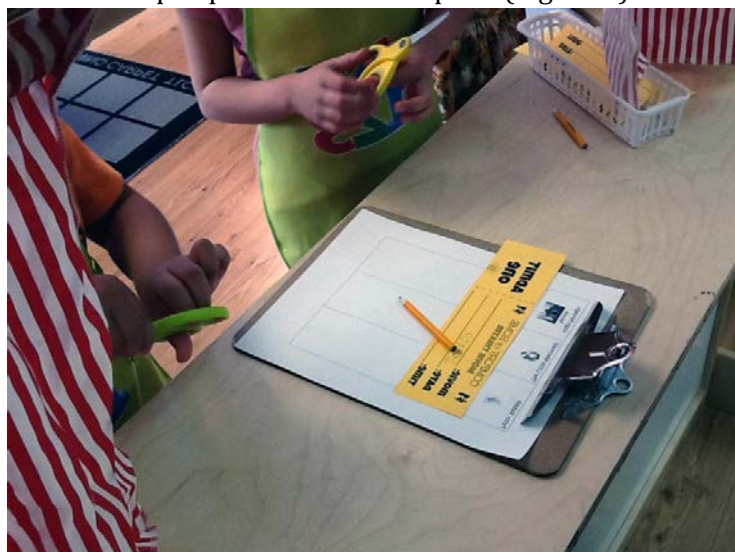
Figure 6. Employees prepare tickets at the box office.

BOX OFFICE. At the box office, the "ticket seller" wrote the title of the movie along with the date and time on the pre-printed ticket template (Figure 6).