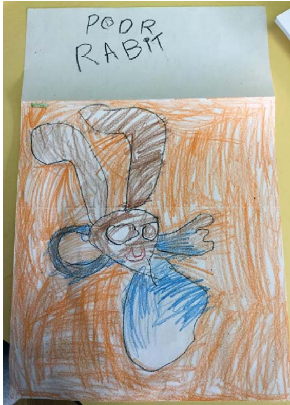
Figure 4. A poster for the “Peter Rabbit” movie.

the teachers provided the children with a pre-printed template showing the features specific to this genre of text (see Figure 5).