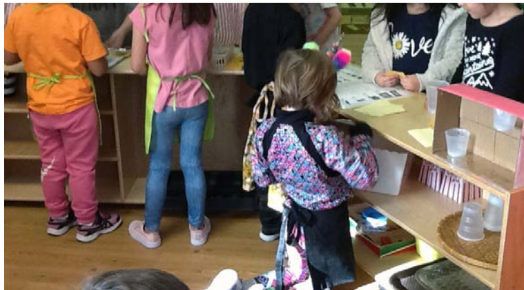
Figure 7. Employees work at the busy concession stand.

CONCESSION STAND. At the concession stand, directly beside the ticket counter, customers read from a menu and looked at the labeled confectionary before giving their orders to the “employees”. The employees wrote lists as they received the orders. To remember which items had been purchased, they brought these lists with them to gather the items together and give to the customers (Figure 7).