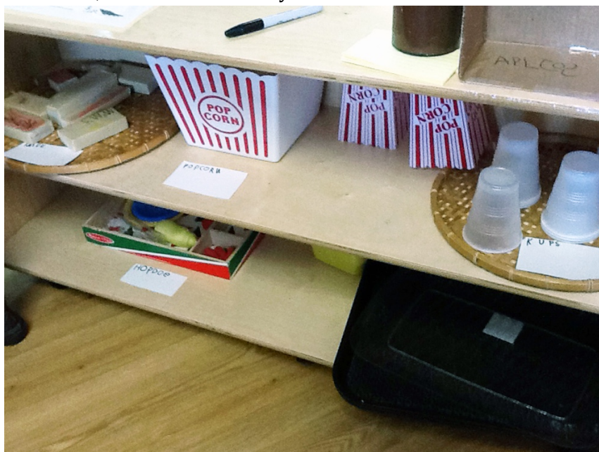
Figure 3. Concession stand items were labeled as “KUPS” [ cups ], “POPCORN”, “HOPDoe” [ hot dog ], and “KANDE” [ candy ].

The children also created movie posters to inform others about the films featured at the theatre, menus to inform customers as to what food they could purchase at the concession stand and for how much, and labels to identify the items stored on the shelves in the concession stand (Figure 3).