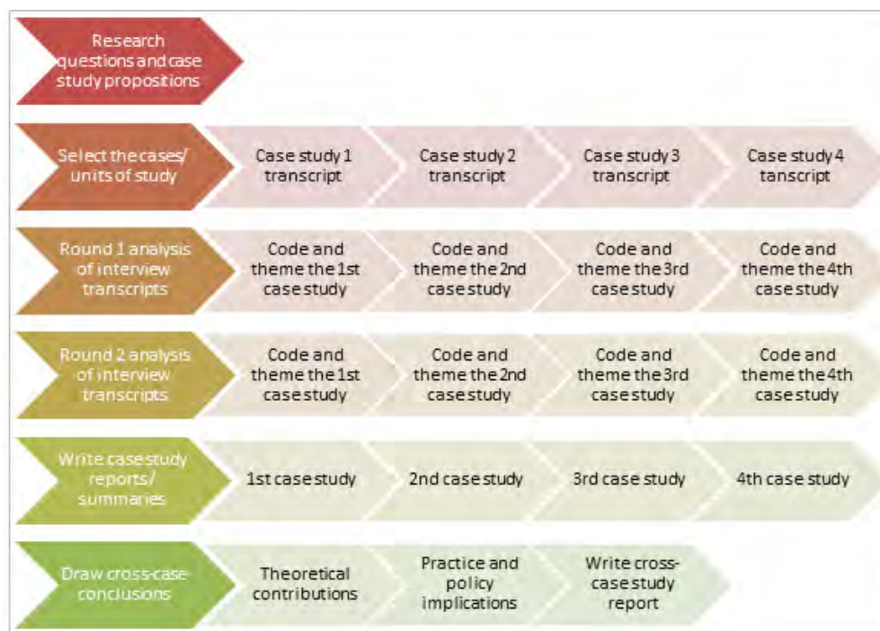
Figure 2. Multiple case study analysis process adapted from Yin (2018, p. 58).