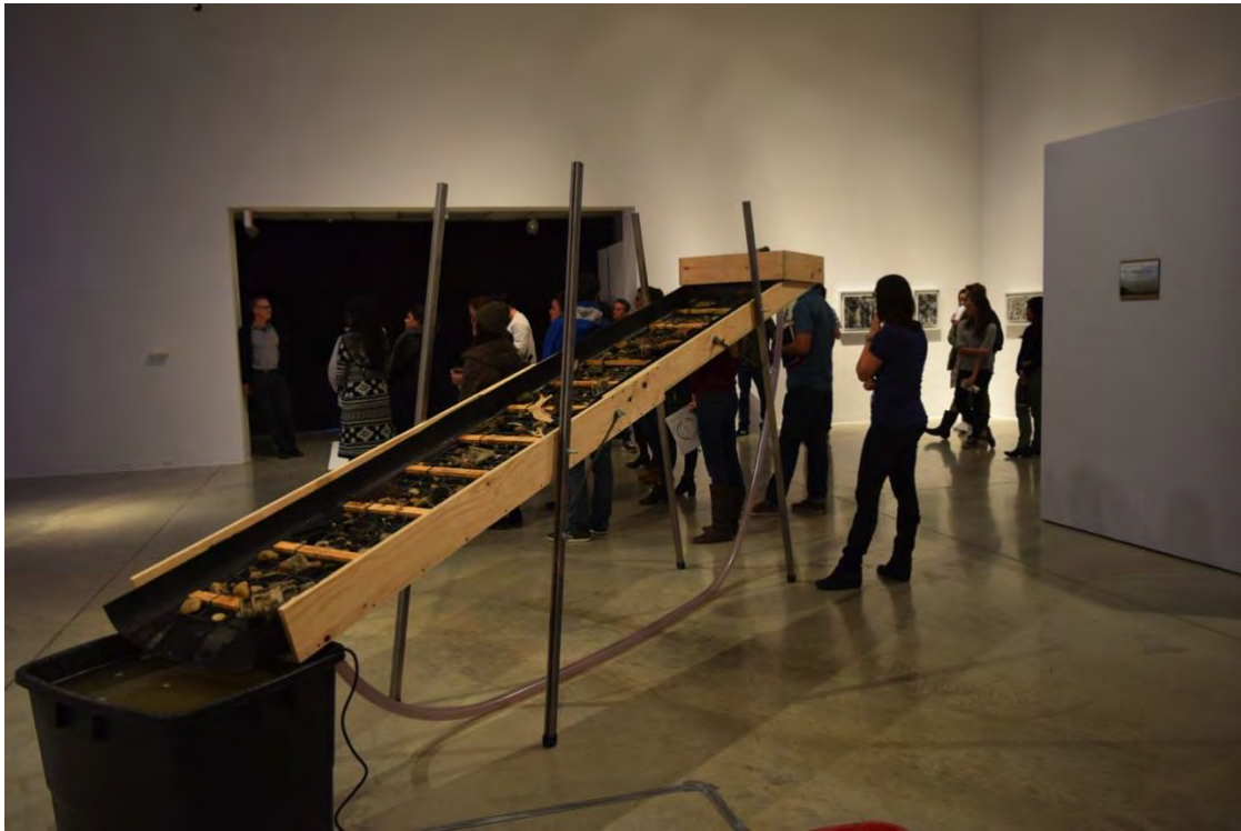
Figure 7. Esteban Ayala, Prospecting , wood, plastic, metal, water, water pump, sand, stones and elements from Portovelo's Yellow River, 400 x 64 x 200 cm, 2016.

On the wall next to his installation was a digital photograph illustrating an almost idyllic countryside of the mountains surrounding Portovelo, taken from the neighboring Zaruma. Yet the following inscription completes the message and brings the viewer to a harsh reality: “El oro en realidad no lo ha visto jamás ninguno” (Gold indeed has never been seen by anyone) (Figure 8). The installation was notable as it appealed to many senses: sounds, smells, and objects that tempted the viewer to actually touch them. The viewer's presence completed the work as a movement detector activated water that ran through the metallic structure. Sand, stones, bones, pieces of ceramic and metal, and other garage-like artifacts were standing there to make a statement on the history of Portovelo and to raise socio-ecological issues at the same time.