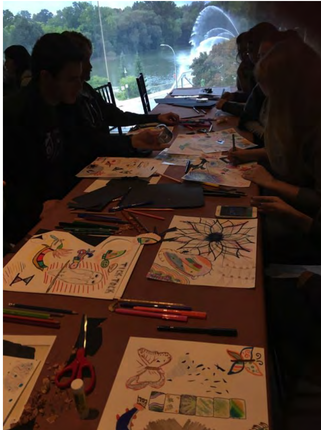
Figure 6. Group workshop in Museum London, October 1, 2016.

were quite flexible: we all started with a blank sheet of paper and needed to draw something. Some models of pre-Columbian motifs were provided to us, but many students used their own imagination. The idea was that after a while our drawing needed to be passed along to our neighbour who would continue our creation, and so on, for about two hours (Figure 6). At the end, we grouped our drawings together on the floor and tried to come up with a story. A student underlined this as her favourite part of the workshop activity, as it allowed her to see how far our design had come, along with the details that were added throughout the collaborative process. This creative activity in Museum London with Z'otz* Collective was much appreciated by the students, as it differed from the academic lectures and evaluations they are used to. It also allowed them to bond and learn from each other in a relaxed environment, each with their own abilities.