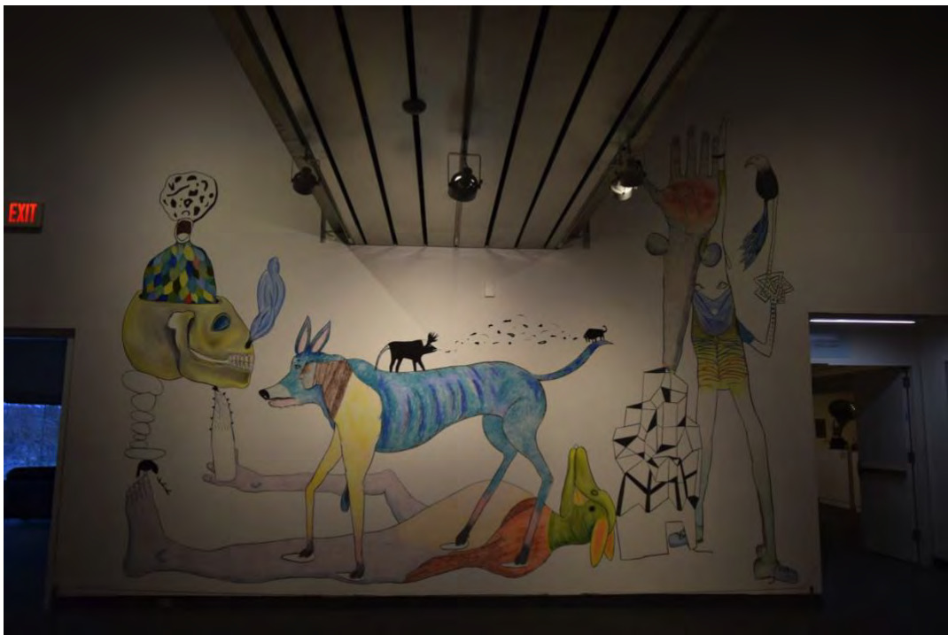
Figure 5. Z'otz* Collective, Mural Painting .

One student stated that he was not familiar with contemporary art prior to viewing this exhibition, yet he appreciated it as it opened new perspectives to him. Through Click! and the creation of Z'otz* (Figure 5) he learned that art could have a social purpose, that a team could collaborate and create something beautiful. However, as a native from a country in South America, he felt somehow excluded from the exhibition. If the purpose of the exhibition was to educate a general Canadian audience about issues raised by Latin American immigrants, then he felt the mission was well accomplished. However, he felt like a stranger in front of the concept of bridges and expressed that some typical elements of Latin America were somehow lost in the exhibition, while trying to appeal so much to an Anglo-Saxon public.