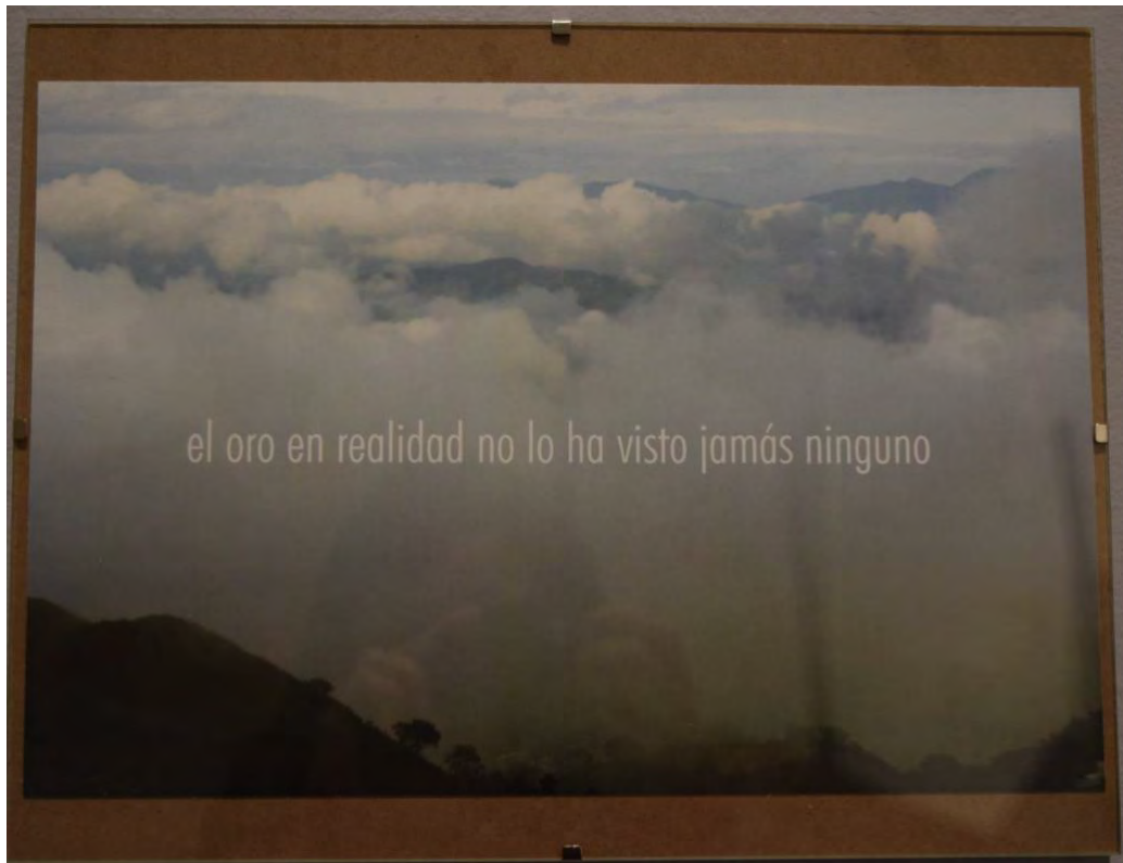
Figure 8. Esteban Ayala, Gold indeed has never been seen by anyone , Digital photo, 20.32 x 25.4 cm, 2015.

Patrick Mahon addressed issues of colonialism and local community in his installations, Ascending and Descending: Water Works/ Mountains (Figure 9). 13 As they toured the community during the artist's residency in the summer of 2015, they witnessed remnants of the American presence separated from the local community residential area, structures, and buildings that changed functions through time and others that remained silenced, such as a cemetery and a swimming pool. While related to a not-too-distant past, they appeared out of context and invited another way of alluding to mining. The swimming pool was photographed and printed on Tyvek paper accompanied by plastic mesh. The visual effect produced by the light reflecting on the mesh creates an optical illusion that resembles the effect of the sun on water, and also changes according to the movement of the viewer. The PVC pipes arranged on the floor form a structure that alludes to the mountainous topography surrounding Portovelo, but also echoes the metallic structures of the swimming pool in the photographs.