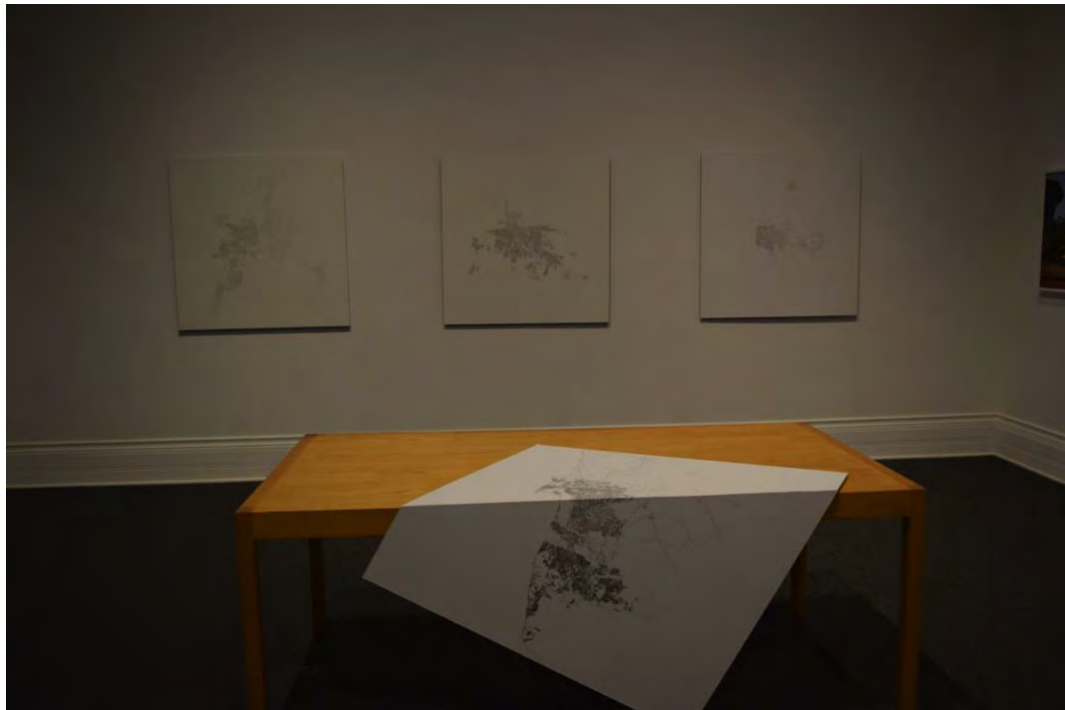
Figure 4. Manolo Lugo, Borders Towns .