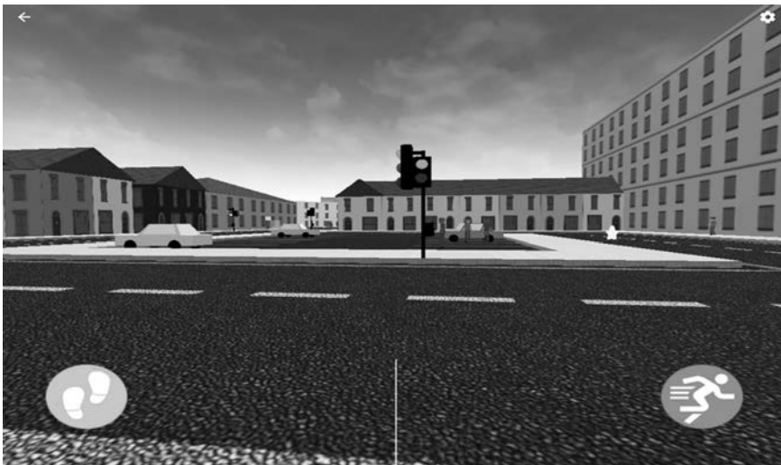
Figure 2. Screenshot of the city from the player's viewpoint, when holding the iPad up vertically in front of them.