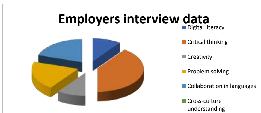
Figure 3 Employers' Interview Data

The most demanded skills for learners are digital literacy, critical thinking and problem solving. The requirements of employers are different they put critical thinking in the first place but they are also interested in problem-solving and collaboration in languages. So, data gathered through the interview have much in common with data of questionnaire and this verify the quantitative data.