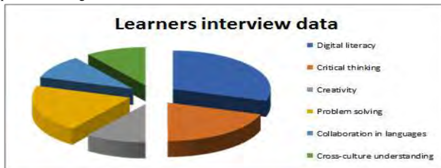
Figure 2 Learners Interview Data

skills in order of the importance, the results were also processed. The data obtained are presented in Figures 2 and 3.