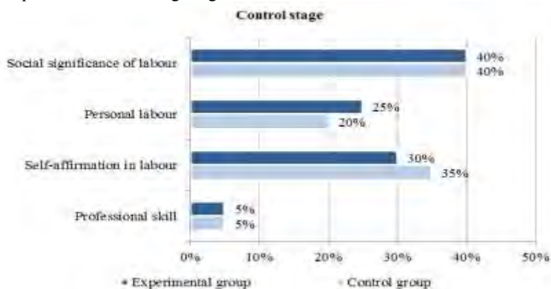
Figure 3 Percentage Ratio of the Studying Motives for Students of the Experimental and Control Groups at the Control Stage

The results of the research conducted among students has shown that for practicing their professional activity its social significance is of great importance. This means that the majority of students believe that their work should be useful to society and recognized by them. As the second in the ranking of the motives of learning, students mention the self-affirmation motives in work. It is important for students that their future profession satisfies their interests and needs and helps them to realize their abilities. The motive of respondents' own work ranks third, that is, the nature of the work itself is more important for these students than other factors. Motives of professional skill occupy the last place among the respondents. Most likely, this is caused by the age characteristics of