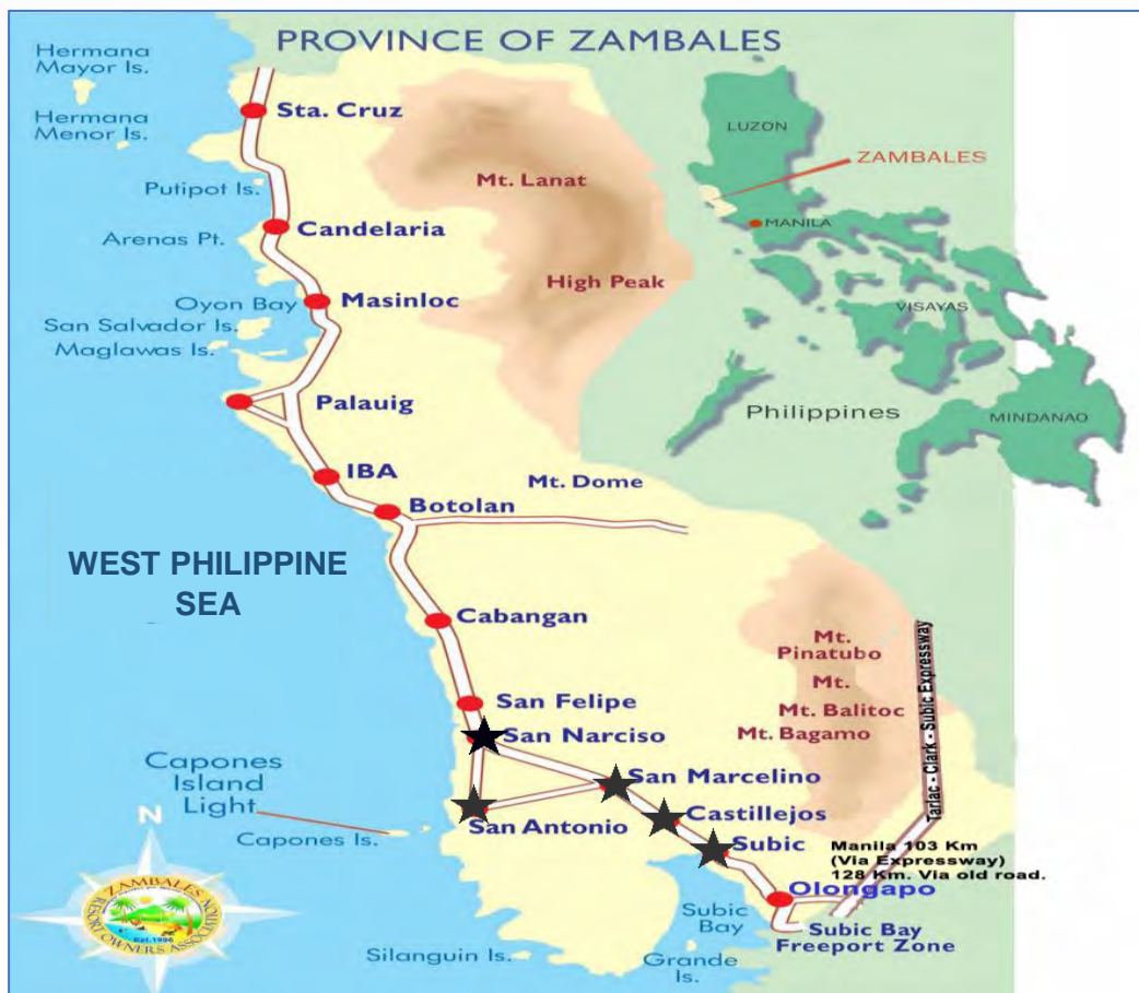
Figure 2. Map of Zambales, Central Luzon, Philippines

The site of the study was in southern Zambales in Central Luzon, Philippines (Figure 2) and includes five towns: San Narciso, San Antonio, San Marcelino, Castillejos, and Subic. The sites were selected because barrio communities in these towns have experienced major disasters such as earthquake, typhoon, volcanic eruption, landslide, and others.