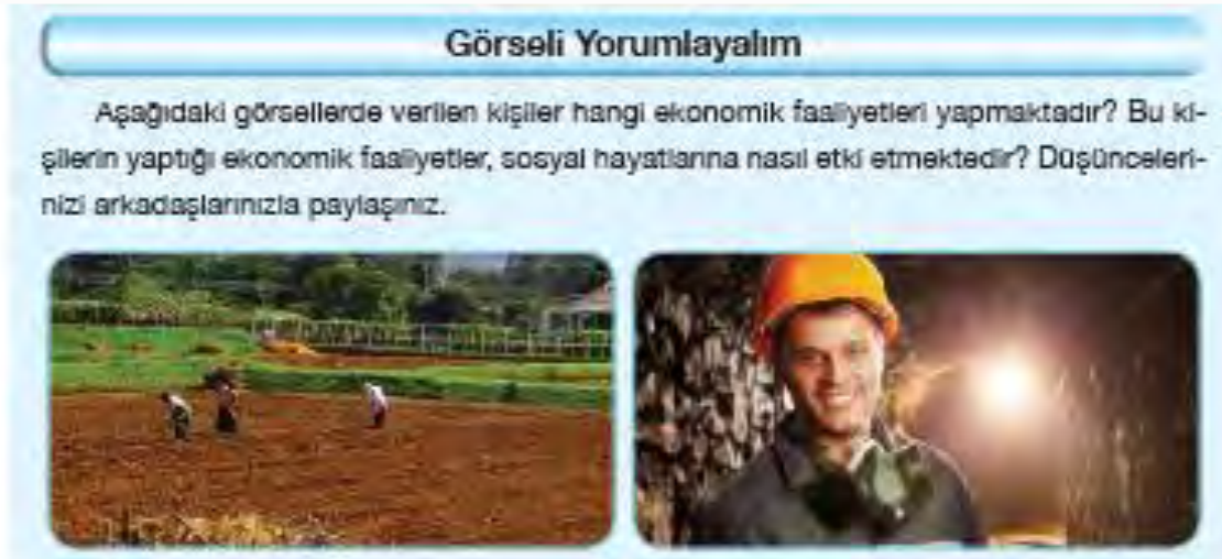
Figure 4. Economy and social life unit, a question about spatial analysis (secondary school and Imam Hatip secondary school social studies 5th grade textbook, Şahin, 2018, p. 132).

In the Production, Distribution and Consumption learning area under economic activities, the unit warm-up question is associated with spatial analysis: "How do people in and around where you live meet their needs? Share your ideas with class." To answer this question, students are required to analyze space in relation to performed economic-activity types. The following questions are related to spatial description and analysis: "search the economic activities in and around where you live. In your research, pay heed to the geographical features of the place you live in and its surrounding. Share findings of your research in a poster. You can use visuals to enrich your poster assignment." and "below you can find some of the economic activities in Turkey. Please write next to each activity the kind of geographical feature that enables this activity" are the research assignments that indicate. For these questions' students are first required to gather data about a specific environment and then analyze the data to draw a connection between geographical factors and spatial features.