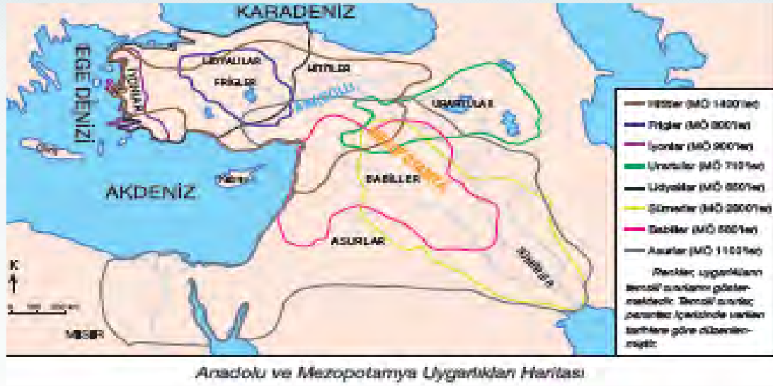
Figure 1. A model map for the spatial description in 5th grade social studies textbook (secondary school and Imam Hatip secondary school social studies 5th grade textbook, Şahin, 2018, p. 35).

Figure 1 in the grade 5 textbook illuminate's spatial relations about Anatolian and Mesopotamian civilizations. Hence, the positions of these civilizations between themselves according to continents and sea can be defined. For instance, it can be reasoned from the map that the Frigs existed to the south of the Lydians and east of the Aegean Sea. Building spatial relations in this way shows that the map activity is aimed spatial description.