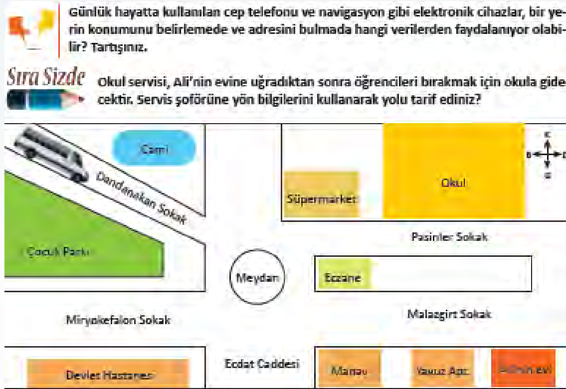
Figure 5. In People, Places and Environments learning area, in 'My Place on Earth' unit, questions which are about spatial description (secondary school and Imam Hatip secondary school social studies 6th grade textbook, Yılmaz, Bayraktar, Özden, Akpınar and Evin, 2018, p. 94).

environmental features. Also, the presence of maps in all of the units is a sign of spatial description.