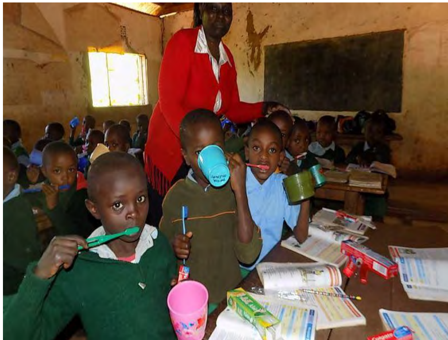
Figure 3. Practical lesson on how to brush teeth.