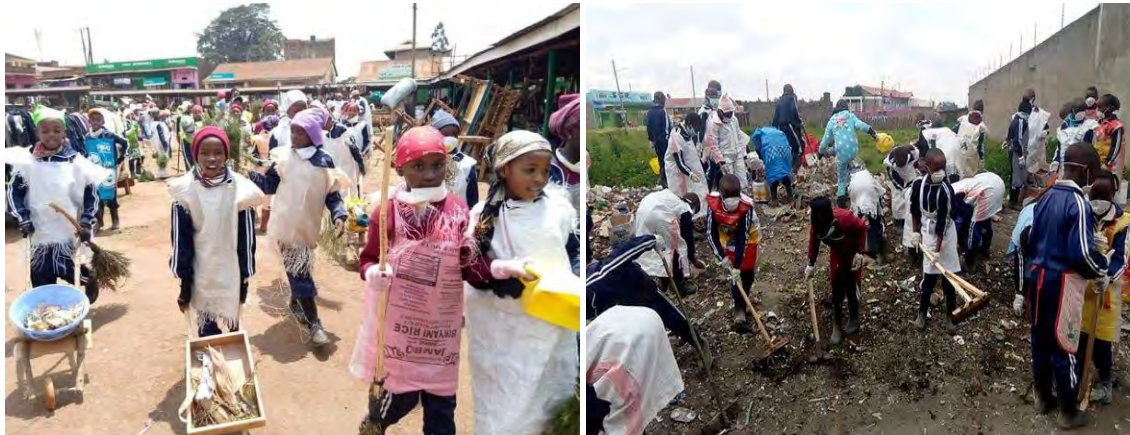
Figure 2. Primary school pupils' community cleaning exercise.