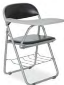
Figure 1. The classroom chair