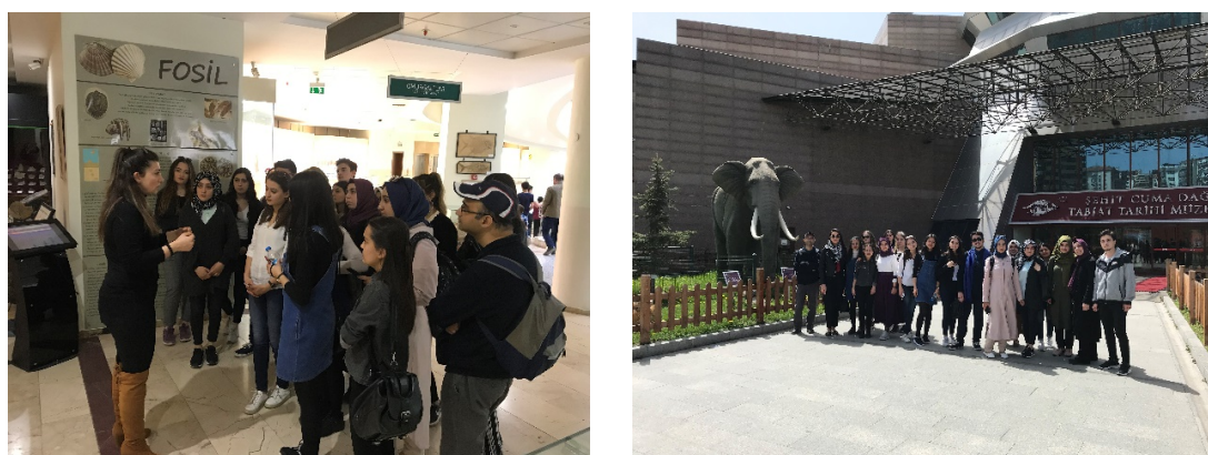
Figure 2. Photos from the museum visit