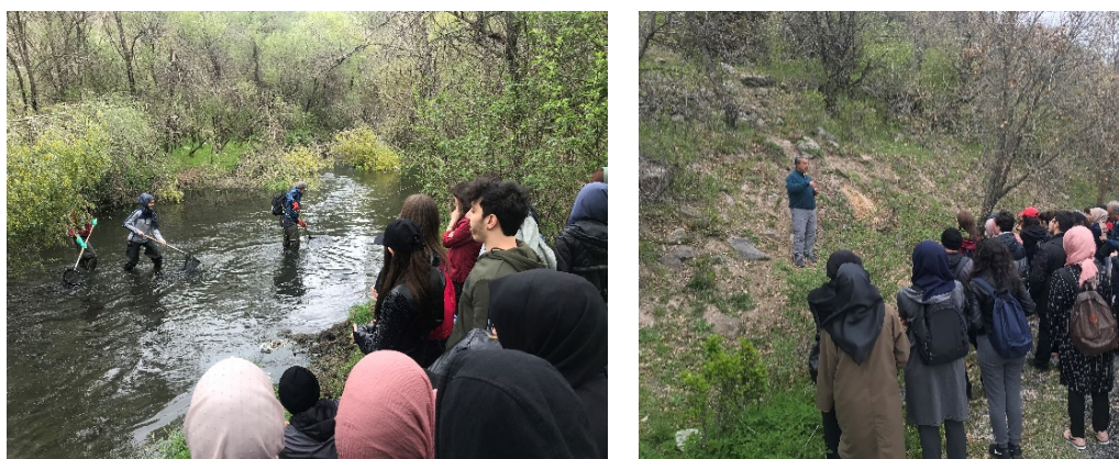
Figure 3. Photos from the scientific field trip