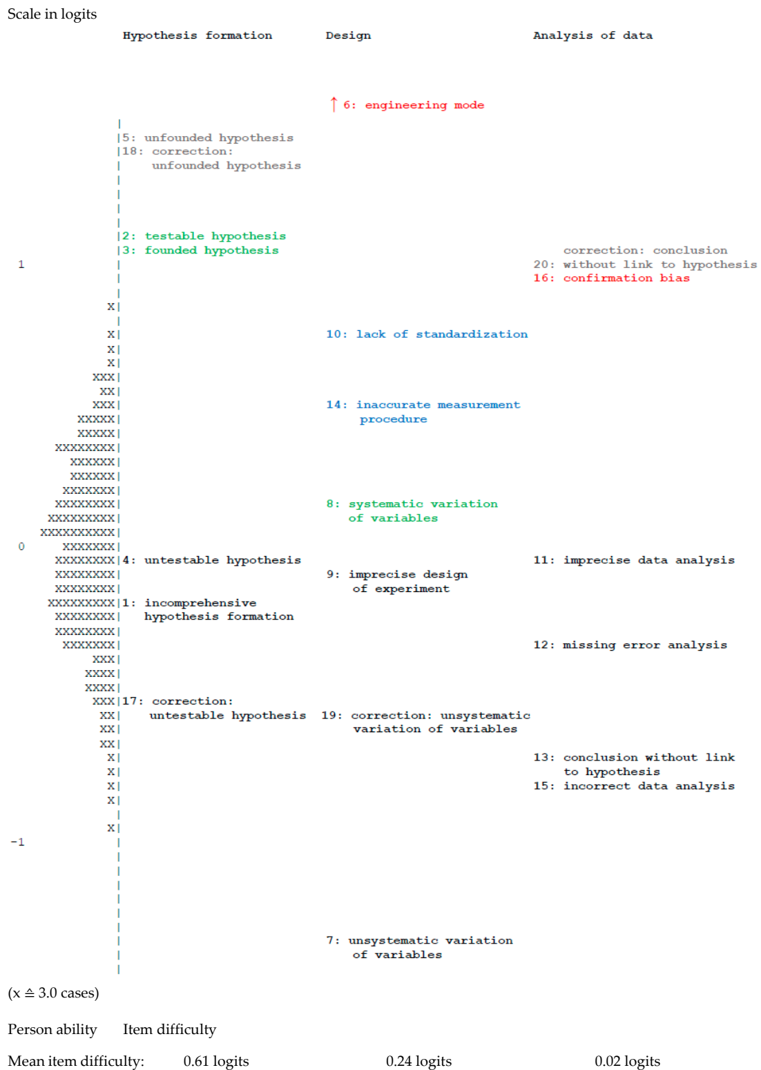
Figure 5. Wright Map of the case-centered 1D IRT modeling of knowledge of what to assess regarding experimentation competences (without item steps) (↑ = the item difficulty is greater than presented).