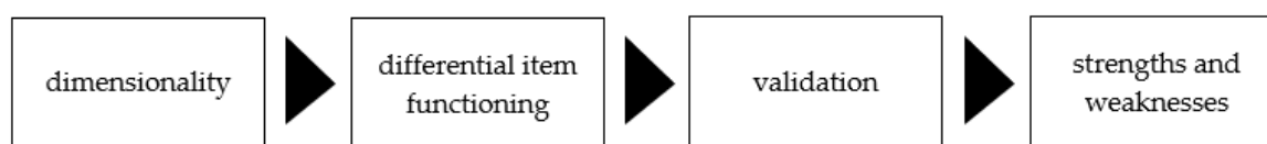
Figure 2. Foci of data analyses of pre-service teachers' knowledge of what to assess .